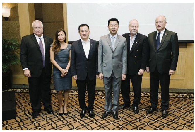
Breakfast Seminar on "Future Airport Infrastructure in Thailand" with President of Airports of Thailand (AOT)