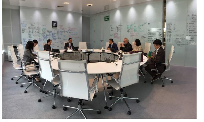
Minister of Science and Technology