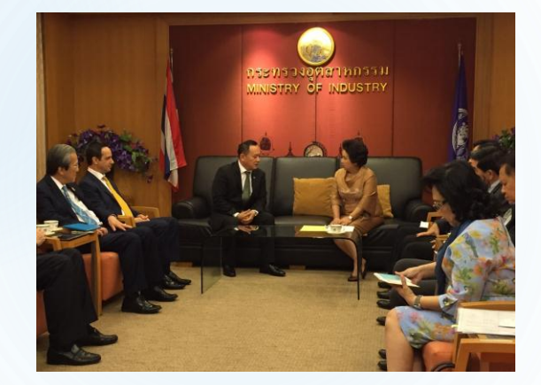
Minister of Industry