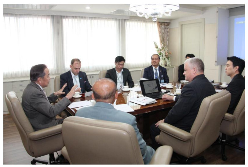
Courtesy Dialogue with Chairman, National Broadcasting and Telecommunications Commission ( NBTC )