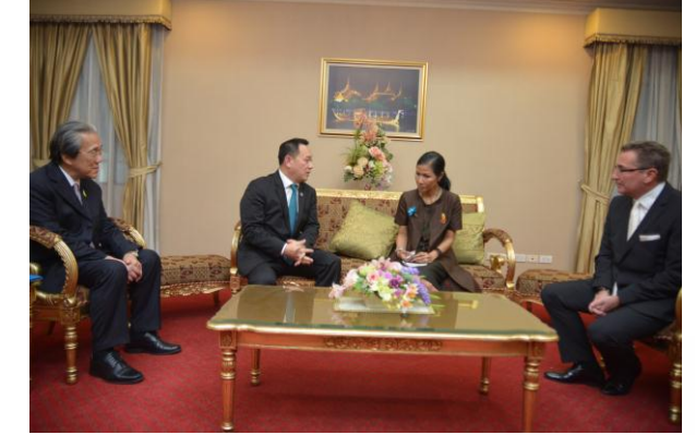
Minister of Minister of Tourism and Sports