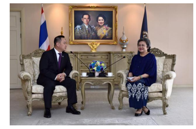
Minister of Commerce