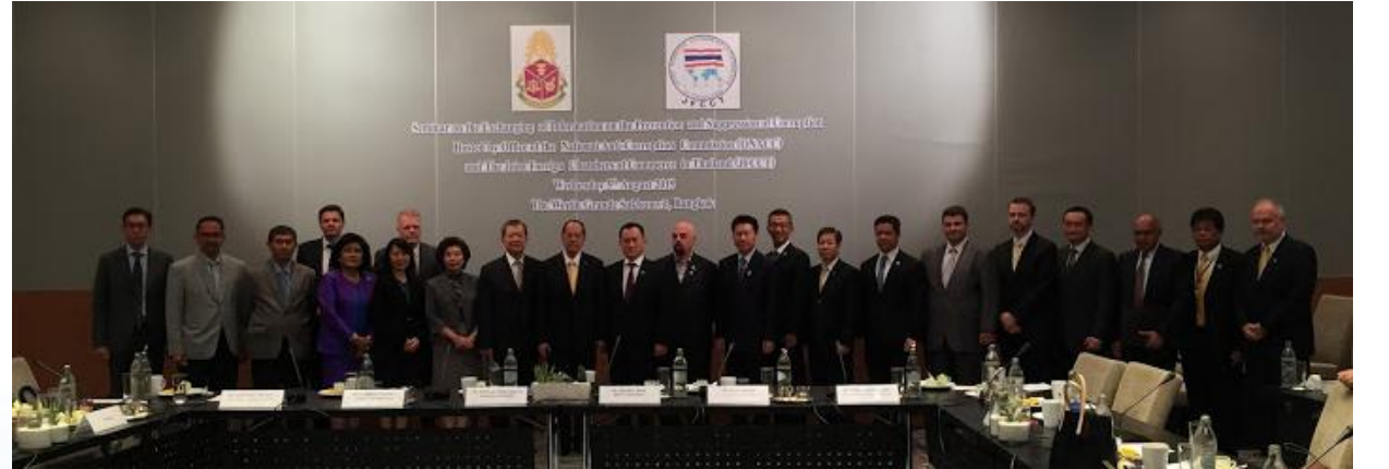
Seminar on the Exchanging of Information on the Prevention and Suppression of Corruption Hosted by NACC and JFCCT