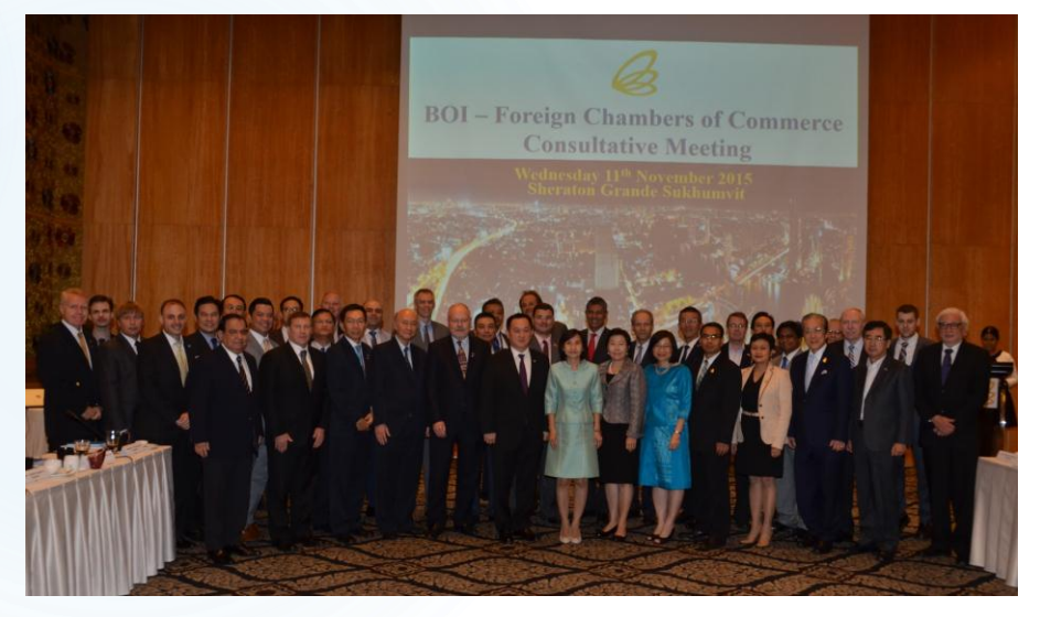
BOI – Foreign Chambers of Commerce Consultative Meeting