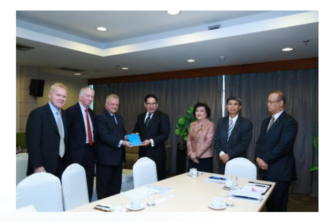
Minister of ICT