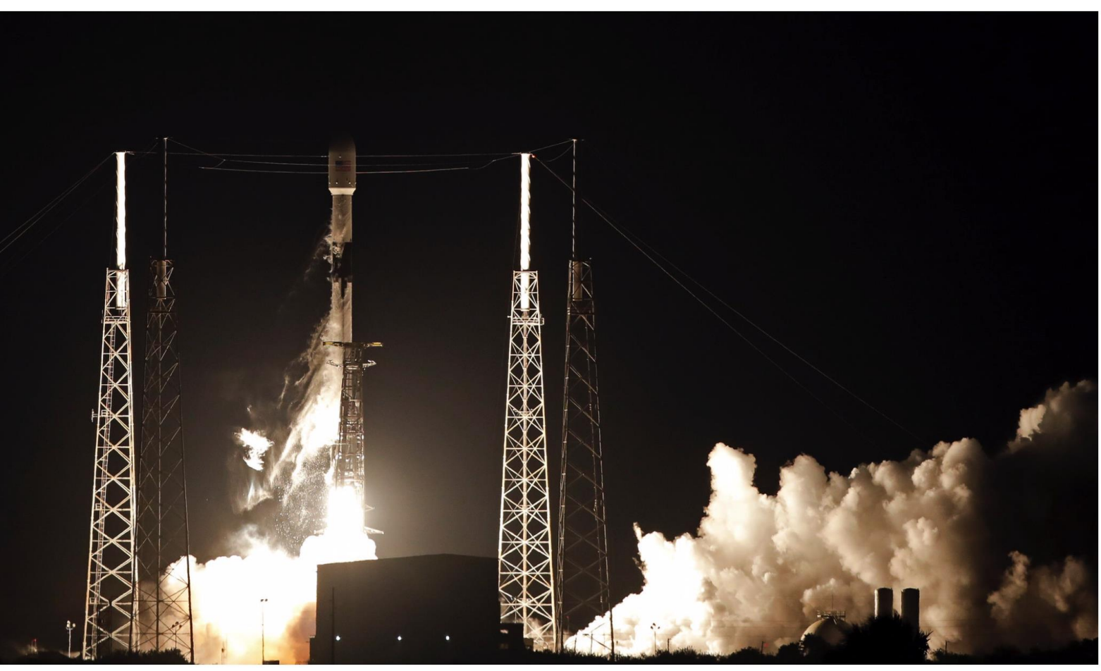
S 2019 CISCO and/or its anniates. An rights reserved, CISCO Connuential

A SpaceX Falcon 9 rocket, carrying 60 Starlink satellites, lifting off from Cape Canaveral Air Force Station in Florida on Thursday.