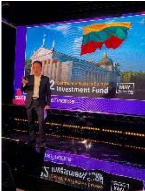
Davos Forum and Startup Fairs