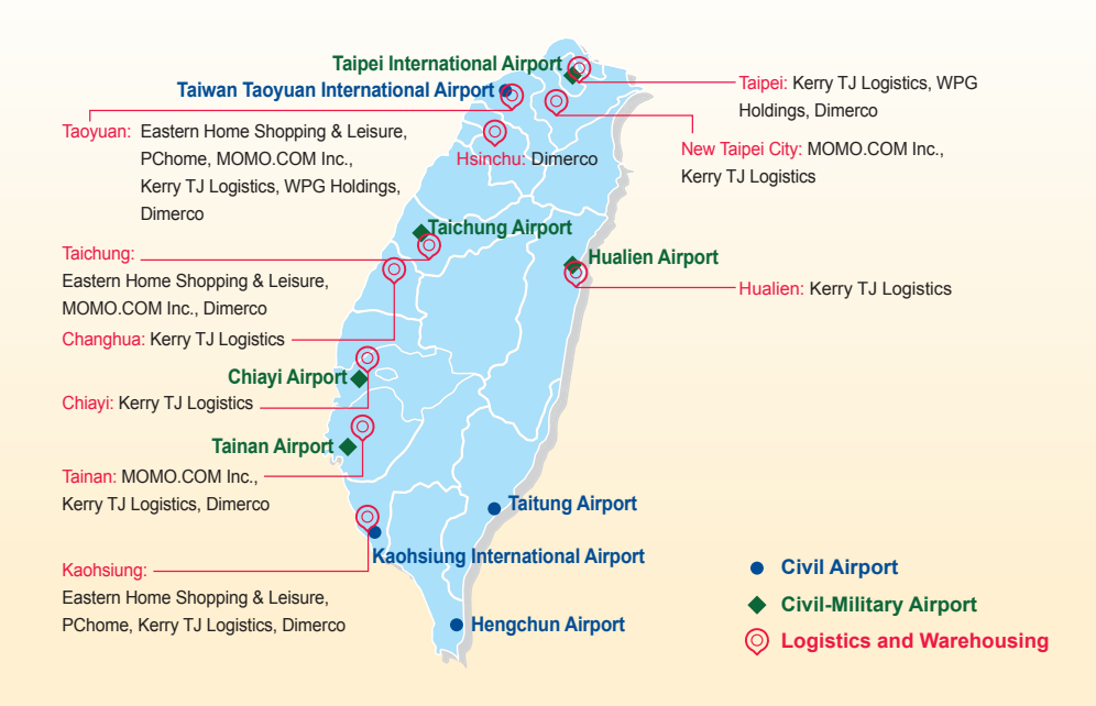
Figure 4 Distribution of International Logistics and E-commerce Industries in Taiwan

Taiwan's logistics and e-commerce industries are located throughout the island (Figure 4). Taoyuan City benefits from an international airport and is a major industry hub for e-commerce and international logistics. More than 2,000 logistics, e-commerce, cross-border e-commerce, and smart system service providers are located in neighboring areas, and they generate an annual output value of approximately NT$180 billion. As industries and related technologies have developed, operators have gradually adopted satellite warehouses and set up small warehouse and logistics sites near major metropolitan areas to provide better services.