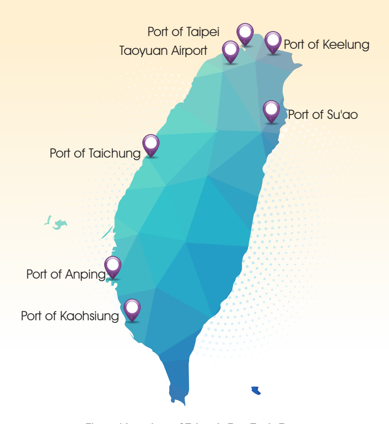
Figure 1 Locations of Taiwan's Free Trade Zones