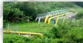
PGN Industrial Gas