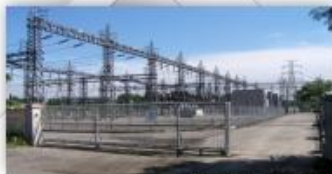
PLN Premium service